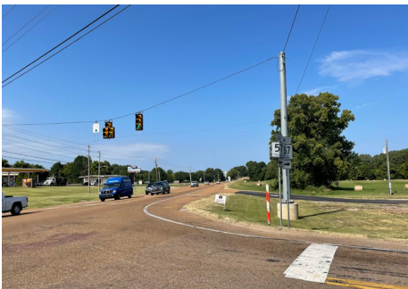
Intersection at Hwy 196 and Hwy 57