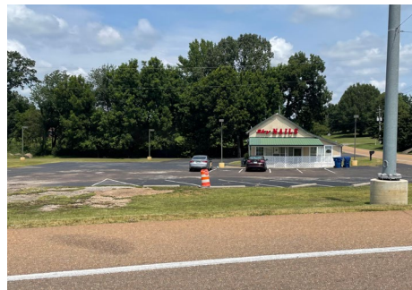
Hwy 57 looking North at intersection