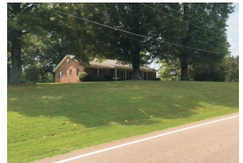
Single family residence on site